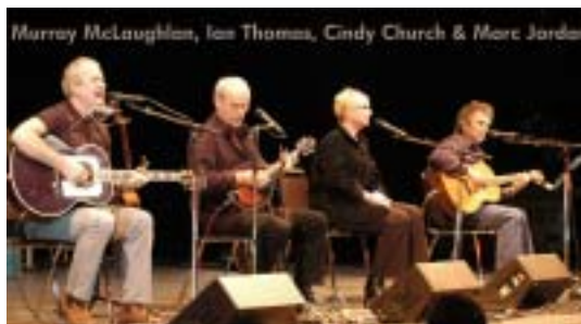
The Group - Lunch at Allen's