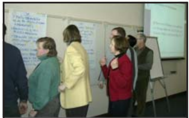
Members of the Board review Strategic Planning Points

I hope that this doesn’t sound like a lot of ‘managementese’, but the people with ALS and their caregivers deserve the best in support, and the best comes from a mature, well-managed and forward thinking Society.